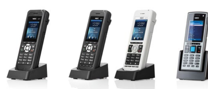
DECT handsets: for any working environment