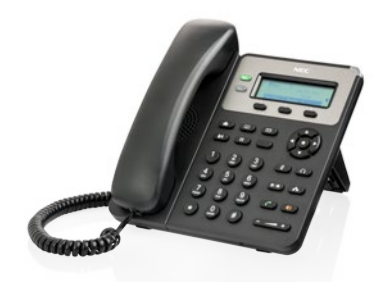
Mono: Easy call control from the office